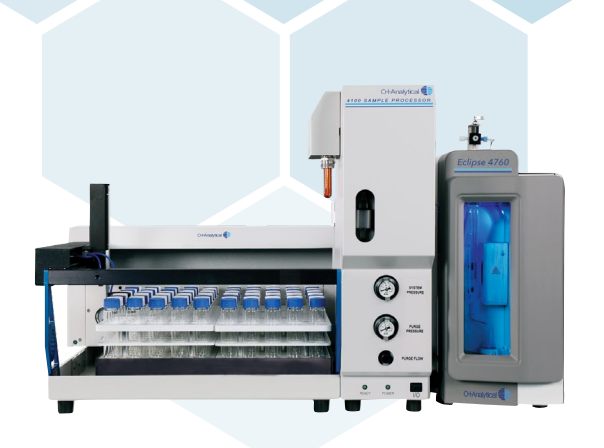
Figure 1. OI Analytical Eclipse 4760 Purge and Trap and the 4100 Autosampler

1,4-Dioxane is a heterocyclic molecule that belongs to a class known as ethers. This compound has been used in the past as a stabilizer for different types of chemicals and is a component of many consumer products such as paint strippers, dyes and waxes. 1,4-Dioxane can also be found as a contaminant in anything from groundwater to cosmetics. Exposure to this contaminant has been shown to have negative health effects and has led to its characterization as a Group 2B carcinogen. Recently, 1,4-Dioxane has become of increasing concern in the environment due to its presence in groundwater at several California sites.<sup>1</sup> Although it is short-lived in the atmosphere due to its hygroscopic nature, it readily leaches from soil to groundwater and is known to migrate rapidly.<sup>2</sup> Although there is currently no maximum contaminant level established by the U.S. EPA, California recommends the drinking water notification level to be less than or equal to 1 \mu g/L .<sup>3</sup>